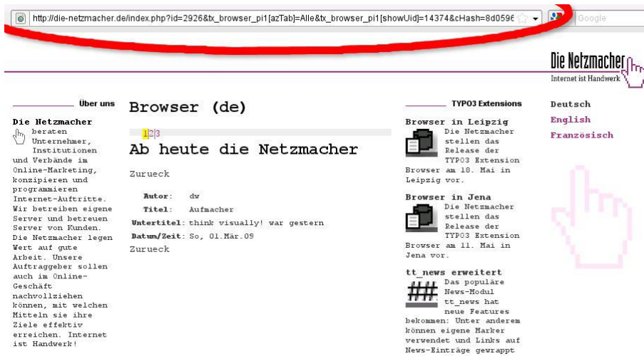
Illustration 1: URL without Real URL