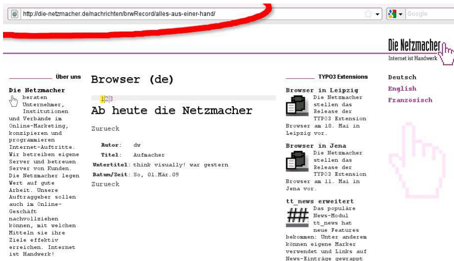
Illustration 2: URL without Real URL